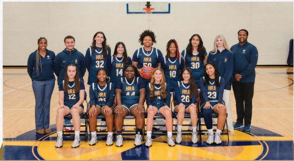
Varsity Girls Basketball