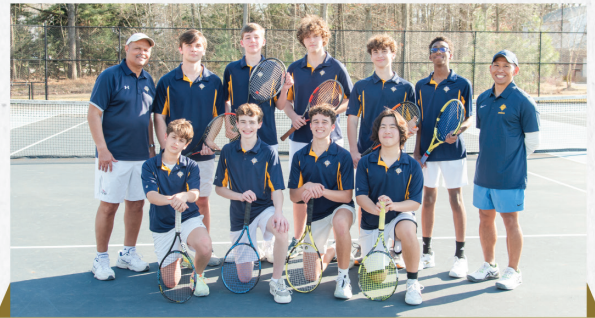
Varsity Boys Tennis