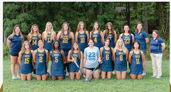
Varsity Field Hockey