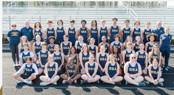
Varsity Track and Field