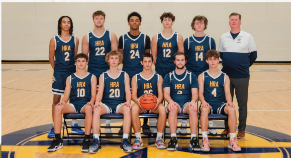
Varsity Boys Basketball