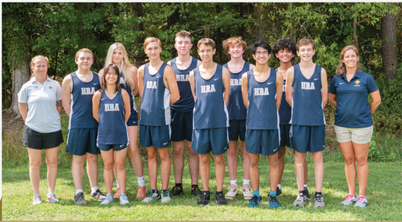
Varsity Cross Country