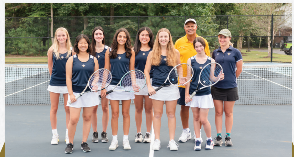
Varsity Girls Tennis