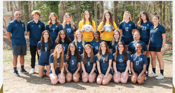
Varsity Girls Soccer