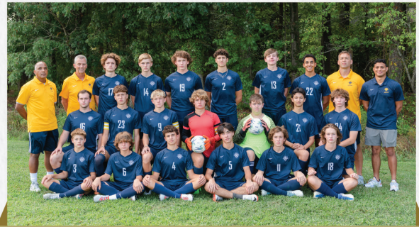
Varsity Boys Soccer